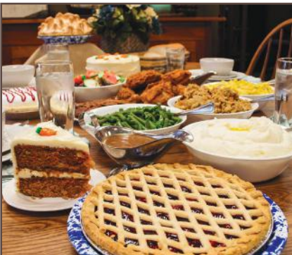
Blue Gate Restaurant & Theatre, Shipshewana