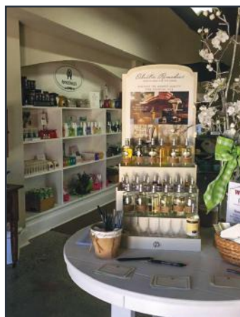
Annie Oakley Perfumery, Ligonier