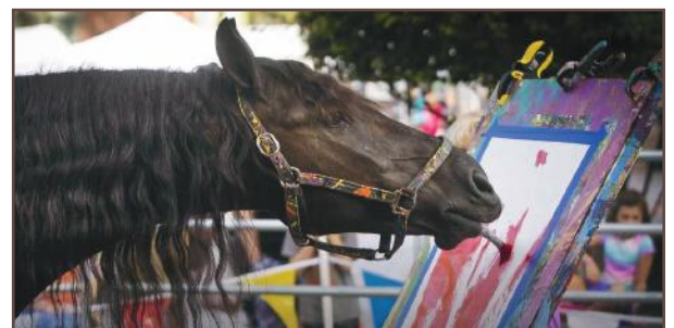
Justin The Artistic Horse, Columbus