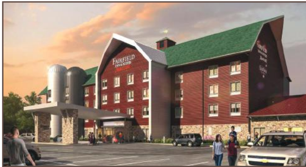
Fairfield Inn & Suites by Marriott at Fair Oaks Farms, Fair Oaks