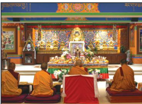
Tibetan Mongolian Buddhist Cultural Center, Bloomington