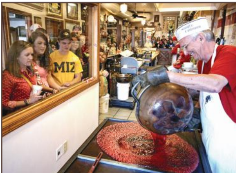
Schimpffs Confectionery, Jeffersonville