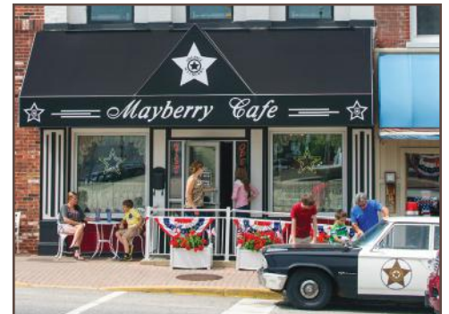
Mayberry Cafe, Danville