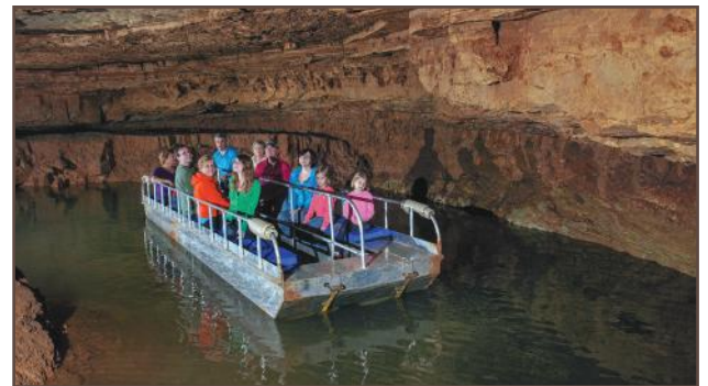
Indiana Caverns is debuting the Bat Chaser Zipline, Corydon