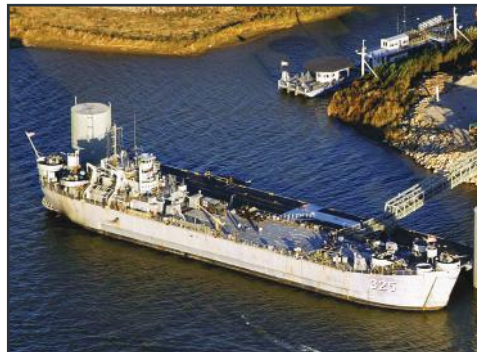
USS LST Ship Memorial, Evansville