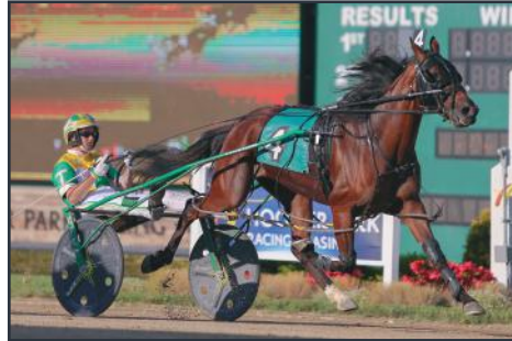
Hoosier Park Racing & Casino, Anderson