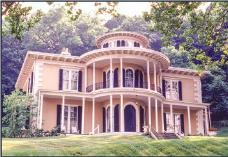
Hillforest Mansion, Aurora