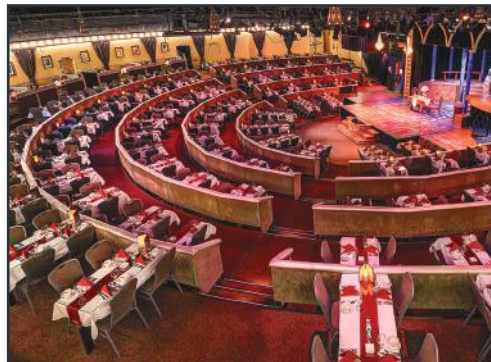
Beef & Boards Dinner Theatre, Indianapolis