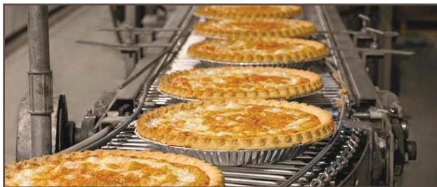
Wicks Pies, Winchester