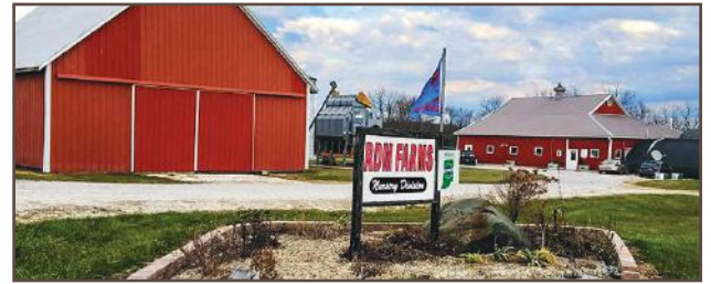
RDM Aquaculture Shrimp Farm, Fowler